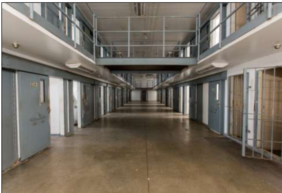
DAY TWO EXERCISES UTILIZE THE PRISON

**Program concludes when final mission is complete and is subject to change. No flight departures should be scheduled prior to Monday morning.